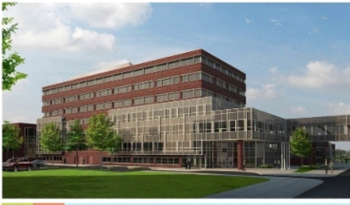
6 th Street Facing East